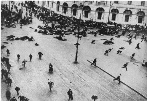
A successful attempt by the Russian Provisional Government to put down a Communist uprising in Petrograd during July, 1917. As a result of this Communist defeat, Lenin fled to save his life.

hearing the propaganda of the Bolshevik leaders as they echoed the program which Lenin had laid down in his Petrograd speech. Stalin, who was back from Siberia, wrote articles in the new Communist paper urging counterrevolution. Trotsky, who had returned from New York, used his brilliant oratory to incite the labor unions and the military forces to overthrow the Provisional Government. "Peace, Land and Bread," was the Bolshevik slogan. Under the circumstances, this propaganda was bound to have some appeal.