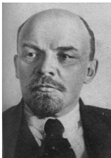
Nikolai Lenin. first Communist dictator: "Marxists have never

In 1870, Nikolai Lenin was born, and in the year 1879, there arrived on earth both Joseph Stalin and Leon Trotsky. Others would come, but these three were to be the principal leaders in carrying forward the traditions of Bakunin and at the same time doing for Marx what he was never able to do for himself; these three would convulse a great nation in a revolution and would serve as midwives at the birth of the world's first Communist dictatorship.