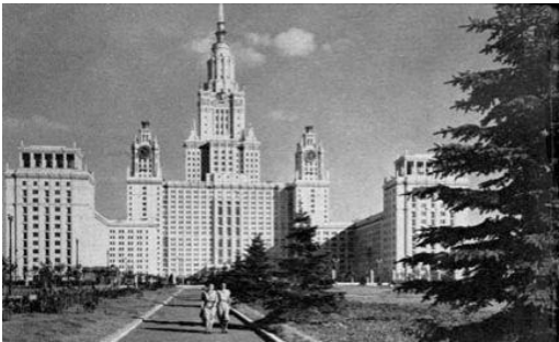
Moscow University -- where education is often used as a political tool and professors are among the best paid people in the U.S.S.R.

Vyshinsky: "The task of justice in the USSR is to assure the precise and unswerving fulfillment of Soviet laws by all the institutions, organizations, officials and citizens of the USSR. This the court accomplishes by destroying without pity all the foes of the people in whatever form they manifest their criminal encroachments upon socialism." 87